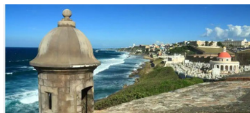
San Juan, Puerto Rico