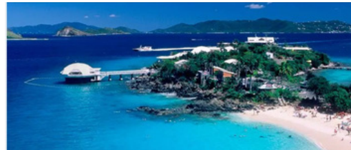
St. Thomas, US Virgin Islands

SALEM TRAVEL • 111 NORTH BROADWAY • SALEM, IL 62881 CALL (618) 548-6000 • TEXT (618) 533-5533 • WWW.SALEMTRAVEL.COM