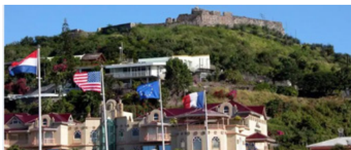
Philipsburg, St. Maarten