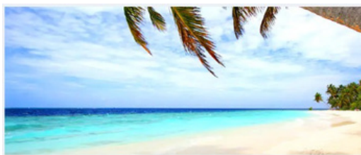
Tortola, British Virgin Islands