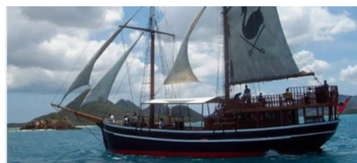
St. John's, Antigua